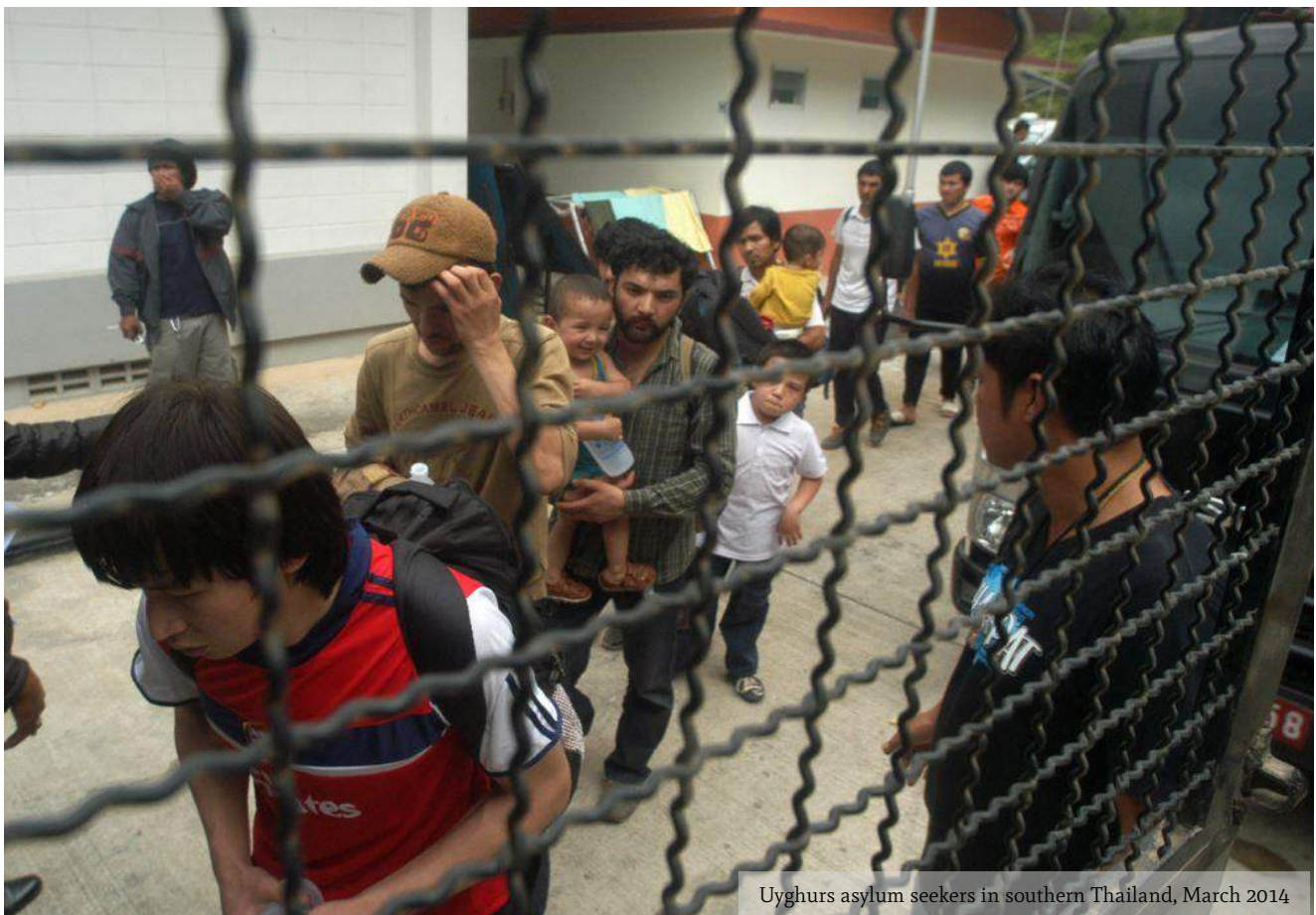
Uyghurs asylum seekers in southern Thailand, March 2014

As of March 2017, a group of around 60 Uyghurs remain in the Thai immigration detention facilities waiting for the Thai government to make a decision on their case.