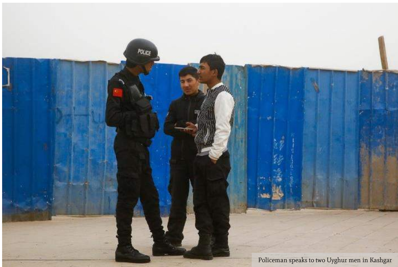
Policeman speaks to two Uyghur men in Kashgar

and legitimate and operates on an equitable basis for all.