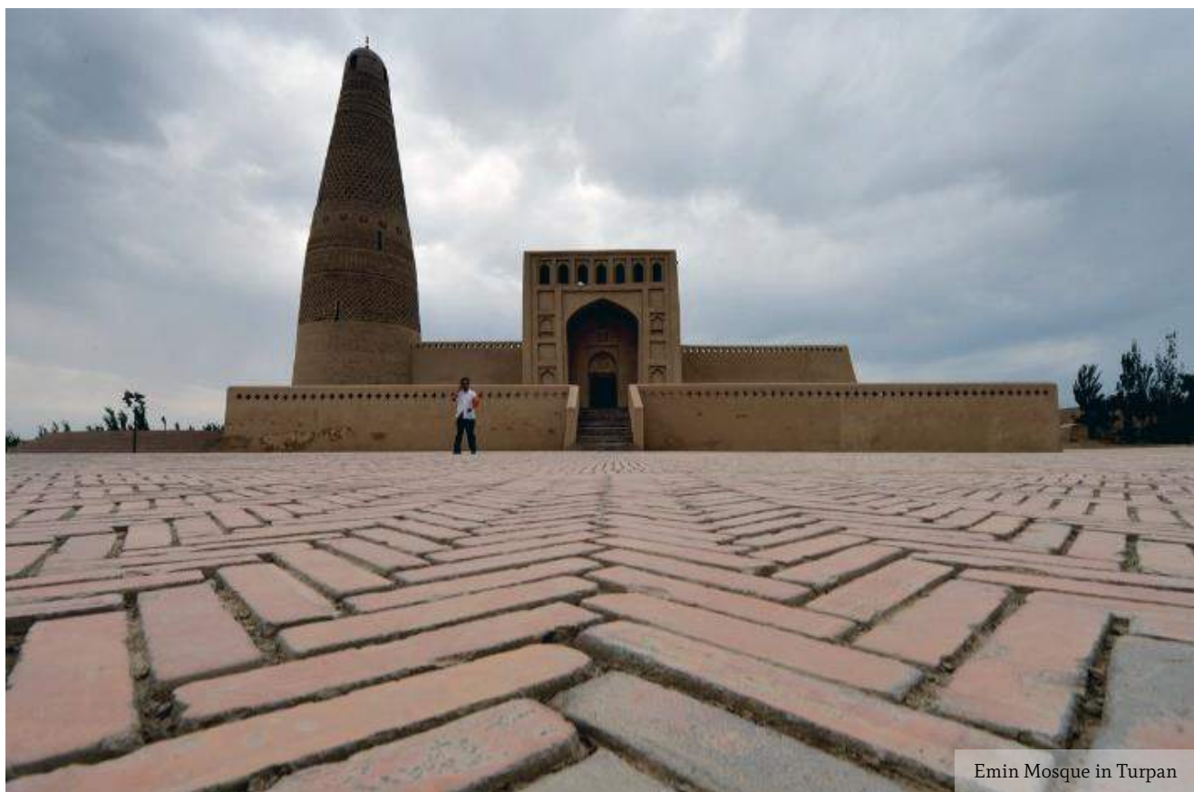
Emin Mosque in Turpan